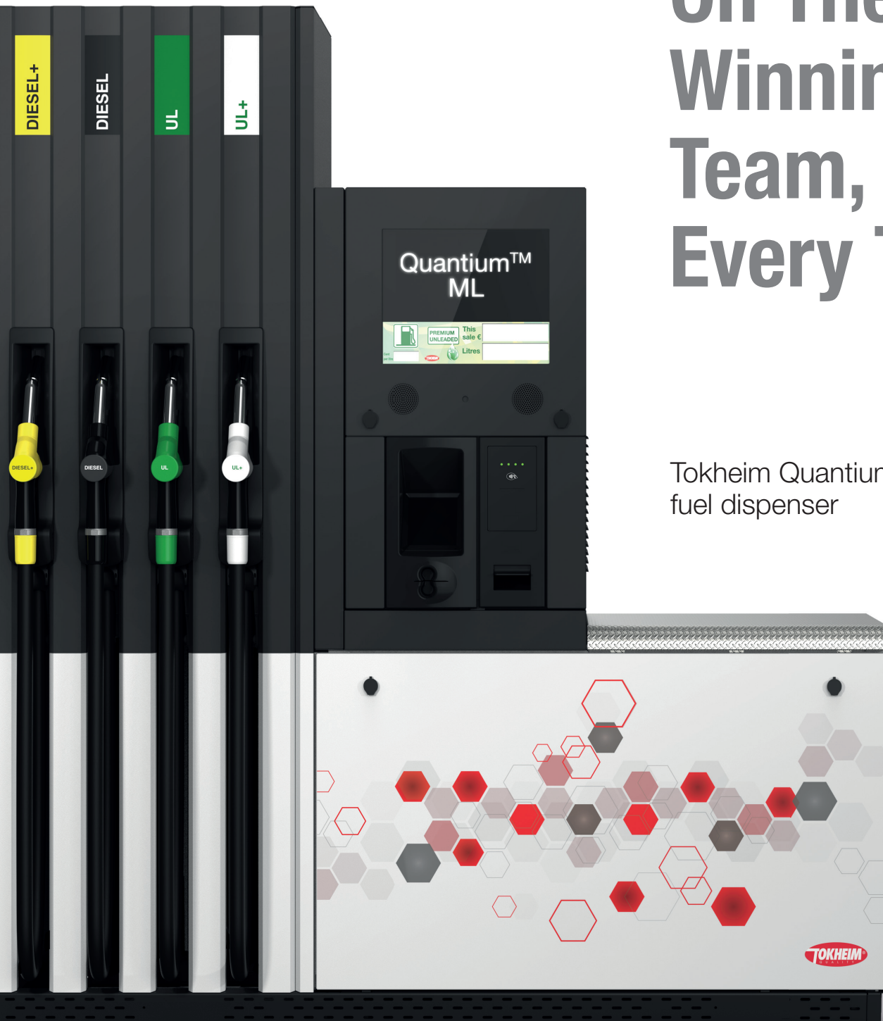
Tokheim Quantum™ ML fuel dispenser