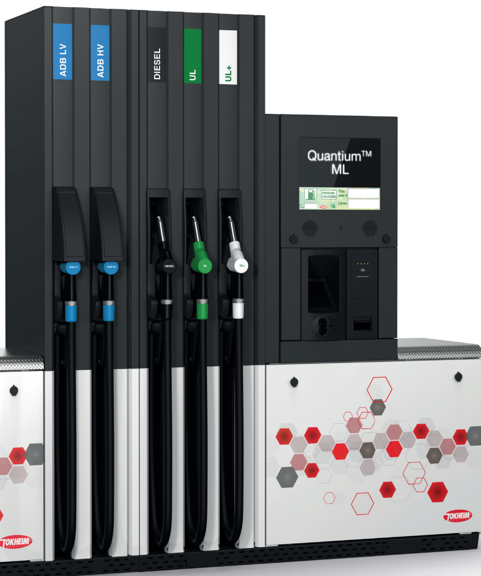
Tokheim Quantum™ ML AdBlue® dispenser

The highly configurable Quantum ML AdBlue® dispenser is here to meet the fueling demands of today and tomorrow. Thanks to our trusted Tokheim quality delivering reliable operation, this dispenser delivery lower total cost of ownership (TCO), has greater uptime than other pumps on the market, thanks to a reduced need for maintenance intervention.